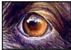
Healthy Canine Eye

Do you find that your pet's eyes are dull, sticky or have a mucus discharge? Is there reddening of the white parts of the eye or the membranes surrounding the eye? If your pet is showing any of these symptoms, call our office for an appointment.